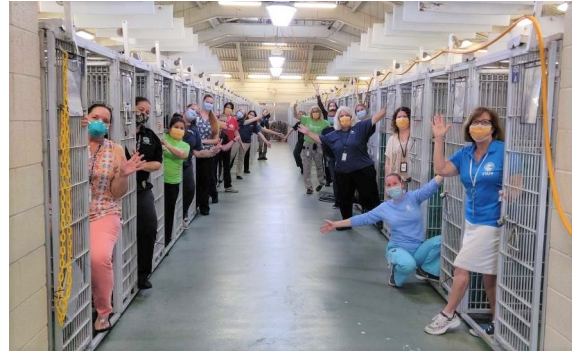
Despite the COVID-19 pandemic, for the first time in the history of Palm Beach County Animal Care & Control, they have a completely EMPTY kennel! Check out their video on this GREAT NEWS!