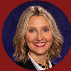
Vice Chair Federal