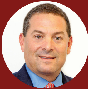
Vice Chair CHS