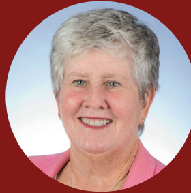
Chair Urban Caucus