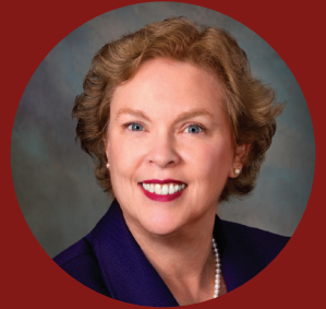
Vice Chair Urban Caucus