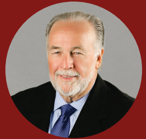
Vice Chair FTA