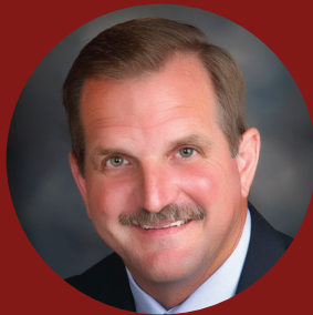
Chair Rural Caucus