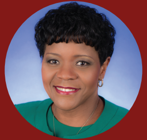
Vice Chair GATE