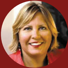
Chair Water Policy