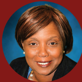
Vice Chair Rural Caucus