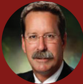
Vice Chair Water Policy